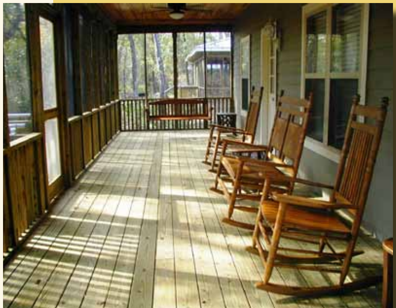
Cabin Front Porch at Stephen Foster Folk Culture Center State Park

Old Town Campground PO Box 522 Old Town, FL 32680 Phone: (386) 542-9500